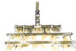
SPRAY BAR FOR DUST CONTROL