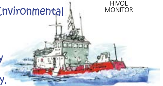
CANADIAN DEPARTMENT OF FISHERIES AND OCEANS

You may notify the Ontario Ministry of the Environment by calling their Spills Action Centre number at 800-268-6060