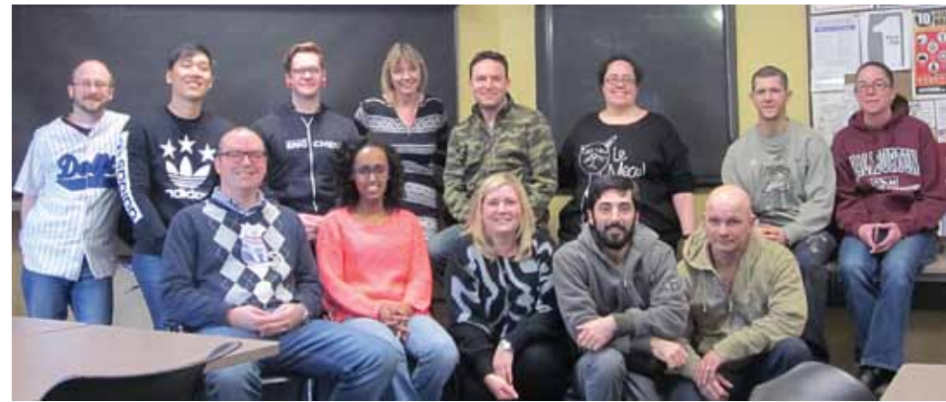
Walker Emulsions - Burlington

Thanks to everyone who participated! Check out all of the photos in the EARTH 1st Blog photo library: http://walkerhome/earth1st/earth1stblog/Lists/Photos/Forms/AllItems.aspx