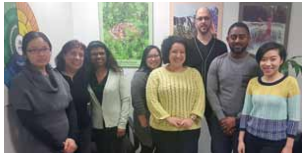
Organic Resource - Toronto