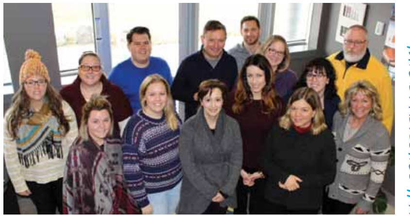
WEG Office Building

YOU ARE WONDERFUL!! CONGRATULATIONS! Clearly no group can, as an entity, create ideas. Only individuals can do this. A group of individuals may, however, stimulate one another in the creation of ideas. Estill J. Green