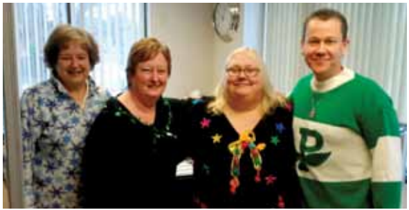
All Treat Farms