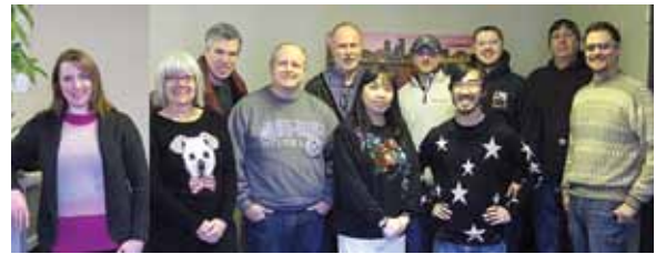
Walker Emulsions - Portland