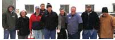
Norjohn - ACI