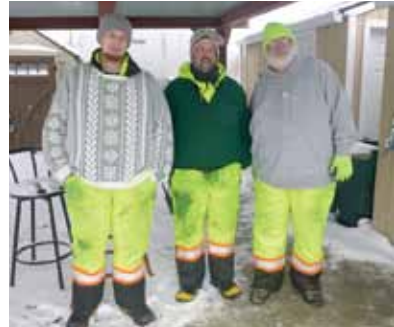
WEG - Drop-off Site