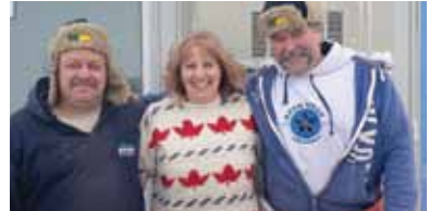
WEG - Landfill