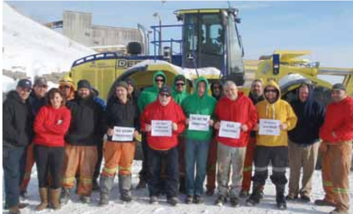
Walker Brothers Quarry