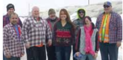
WEG - Compost Site