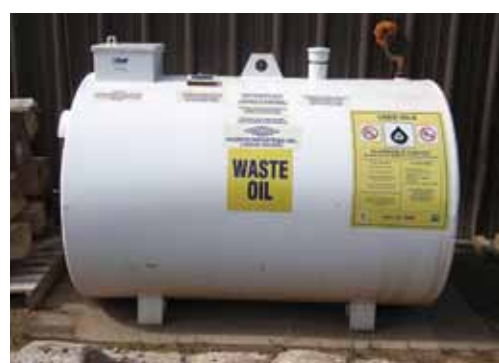
Upgraded Waste Oil Tank