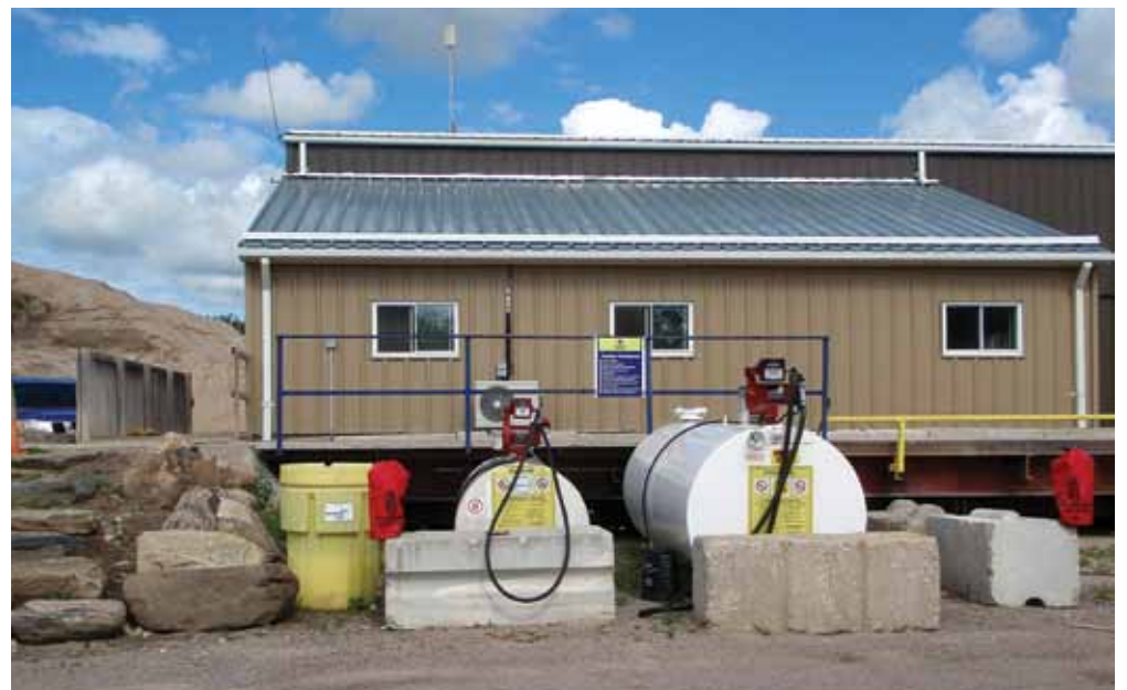
Double Walled Fuel Tanks