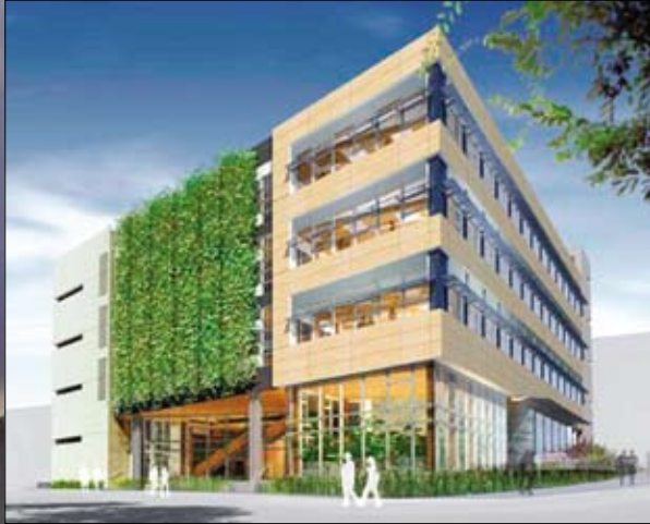
Centre for Interactive Research on Sustainability (CIRS)

The University of British Columbia (UBC) has taken time to plan for sustainability.