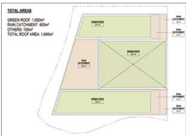
Total Roof Areas: Green Roof and Rain Catchment CIRS Water Supply, Treatment and Reuse Charette 10 June 2008 BusbyPerkins+Wills