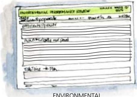
ENVIRONMENTAL PERFORMANCE REVIEW